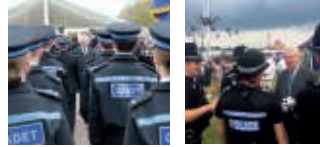
Office of the Police and Crime Commissioner for Surrey

How your Council Tax helps fund Surrey Police