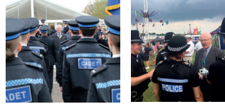
Office of the Police and Crime Commissioner for Surrey

How your Council Tax helps fund Surrey Police