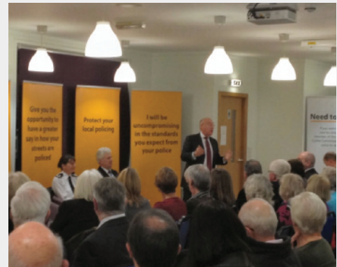
Consultation with residents of Staines-Upon-Thames on budget and priorities

I have now launched a programme of Crime Summits - one in each Borough and District, which will allow the public to tell us - and other public sector partners - their problems and let us work together to solve them.