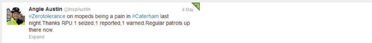
Tandridge Neighbourhood Commander tweets on the zero tolerance approach at work in the District

I would like the concept of Zero Tolerance to span further than Surrey Police alone and reach across all of our public services. I want everyone in a position of authority in our society to feel proud of the important work they do for the public and empowered to challenge problems in their respective fields of work.